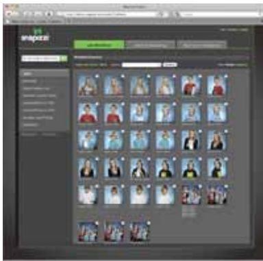
Your interface for job management with guided navigation.