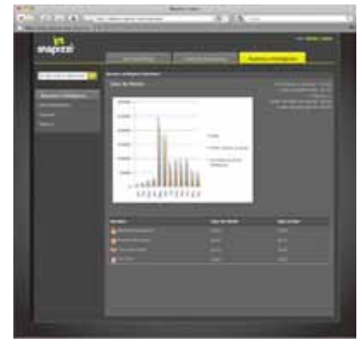
Your interface for business intelligence with job performance analytics.