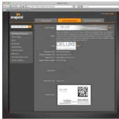
Your interface for branding, sales and marketing tools.